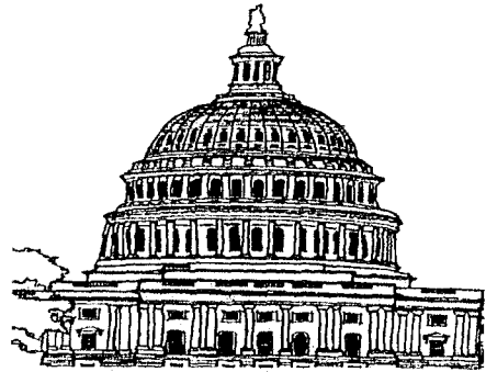
THG Funding of Western New York, Buffalo Region

The Chairman of the Federal Reserve, Ben Bernanke, is trying to stimulate the economy by printing trillions of dollars. ($85 Billion per month) The idea is to get people to borrow money and spend more. He must have already forgotten that is how we got into this mess - borrowing too much and spending too much.